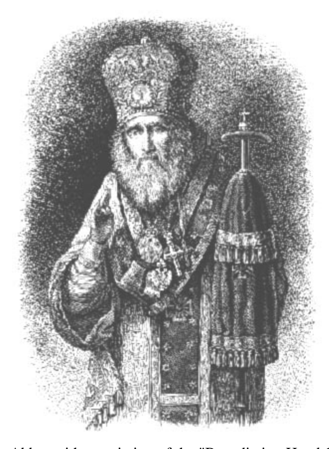
Russian Abbot with a variation of the "Benediction Hand Gesture."

Aside from the invocation of energies, of communion with divine forces, mudras as mentioned before, also have the power to purify the etheric nervous system and the energy-centers to be found in the etheric body. It cleanses all obstructions and congestion that prevents the free flow of pranic and kundalinic forces through the nadis and the chakras. The etheric or "vital" body as it is sometimes called, is the blueprint and the power house of the physical body. When the interface between these two bodies are affected adversely in some way because of the toxins that we generate through negative thoughts and emotions, and the degenerative substances found in the food that we consume, and likewise uncleared karma and trauma, then the physical body would suffer as a consequence. Ill health and a poor immunity system would result. Substances would crystallize in the tissues and the fluid-networks in the body, giving rise to muscular pain, impaired functioning of the organs, and the ossification of blood vessels which technically is the diseased condition referred to as arteriosclerosis. Certain mudras may heal these maladies.