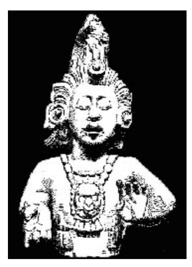
Mayan god with mudras