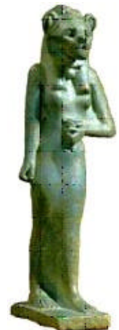
Sekhmet with Solar Plexus Energizer Mudra

5) The Magnetizer Mudra. This mudra has a twofold purpose. It is used to absorb pranic energies from the environment or from some specific source; it likewise is employed for the purpose of magnetizing one's aura so as to strengthen it against invading metaphysical forces. This mudra confers various benefits, it may improve one's health, augment one's store of psychic energy, acquire charisma, etc. To execute this mudra one may sit or stand, or assume the asana as portrayed by the goddess Nephthys: place the left foot underneath the buttocks and sit on it. The right foot is placed on the ground with the knee pointed upwards. Now put your two hands in front of you, palms outwards. If you are doing this mudra to absorb energies then visualize