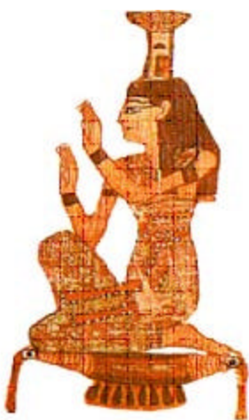
Nephthys with the Magnetizer Mudra

4) The Solar Plexus Energizer Mudra. All felines are symbols of solar energies. So it is apt that Sekhmet, a feline goddess as depicted here, assumes a secret pose that strengthens the sun center of her physical being, or in other words, her solar plexus. The solar plexus has nerves connecting to almost every organ in the body. By channeling energies or concentrating it in the solar plexus, we cause our organs to function optimally. But one must be careful, as over-polarization might cause problems. Assume this mudra while standing or sitting. Breathe normally. Close the left hand into a fist and place it over the solar plexus as shown by Sekhmet. The right hand, should also be in a fist but placed to the side of the body. After 5-10 minutes of maintaining this position reverse the hand positions. The right hand in a fist over the solar plexus, while the left hand to the side of the body. Do this for another 5-10 minutes while mentally asking your Higher Self to energize your solar plexus and also chanting slowly the mantra, "RA-MA" about 9 times.