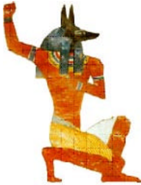
Anubis with Praise Mudra

extended upwards to the side of the head and the hand also is in a fist pointing upwards. A variation of this is to use the right index finger to point upwards. Anubis, the god of the dead, has modeled this pose nicely for us. Maintain this position for 5-10 minutes while giving silent thanks to God for the life within you. During which time breathe normally while chanting the mantra, "EMA-HA." In a little while you will feel regenerated. You will feel joy pervading your being.