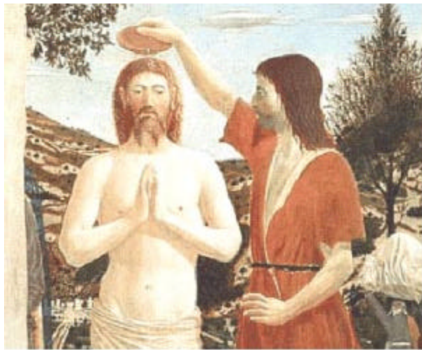
Jesus with the Energizer Mudra (Sign of Prayer)

This mudra generates a certain energy within one's bio-magnetic field. It is a hand pose to be found in the practices of countless spiritual traditions and religions. While in prayer we often assume this pose and arise out of it spiritually strengthened and nourished. The power generated with the use of this mudra uplifts the mind giving one a new zest and enthusiasm for life. Needless to say, one of the secrets of prayer is the pose of the body and hands that configures one's energy structure to greatly facilitate the communion between worlds and the exchange of forces.