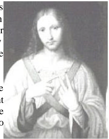
The Christ Wisdom Mudra

This mudra develops in us spiritual wisdom. As mentioned in a previous chapter, every finger symbolically and magnetically represents a certain element. In this mudra we have spirit or ether (middle finger) acting on air or the mental faculties (index finger). When the mind is influenced by spirit it develops spiritual wisdom-not the wisdom of this world, but the wisdom of the gods that transcends human understanding.