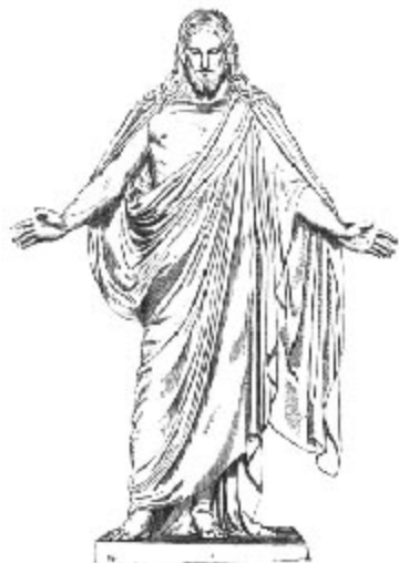
The Channeling Hands

If we can curse and swear at one another so easily why is it that no one ever thinks of blessing one's fellow men? Blessings, or Barokah as it is called in Islam, are dynamic operations of the Divine Spirit acting through pure instruments, whether angelic or human. Ideally, the operator channeling blessings from on High must be pure in mind, body, and soul and have attained a certain degree of attunement and oneness with his/her Progenitor. Whatever flows through a conduit is tainted by it. This is how energies are transformed into force. Force is energy imbued with a certain quality or character. It is for this reason that some degree of spirituality must be attained before one is qualified to serve as a channel for blessings to others, for it is inappropriate to radiate from our beings the quirks and negative characteristics of our personality. At least, when giving blessings, we should strive to raise our vibrations and frequency to match as much as possible the standards of our Higher Self. How this is done may be learnt from a true spiritual teacher.