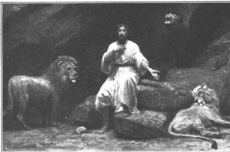
The Beast Master (Sign of Faith)

In order to manifest anything, one must first accumulate psychic energy. There are many methods of doing this which are taught in metaphysical schools. One must also be able to release the thought-form to angelic intelligences and elementals and to urge their cooperation in the work of manifestation of which in this context we act as the First Cause. Their help are essential and this cannot be done if we do not acquire and maintain a good relationship with these beings or have authority over them. In the biblical story of Elijah mentioned previously, these elemental and angelic beings are represented by the ravens.