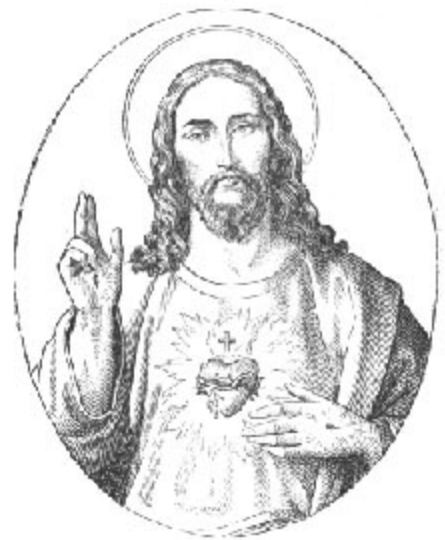
The Benediction Mudra (Sign of Blessing or Blessing, Mano Pantea)

In the 3rd and 4th centuries after the advent of Christ, because of political and egoic ambition, the leaders of the Outer Court divorced itself from the Inner Court and even attacked and persecuted its members and hierophants. Later known as Gnosticism, the doctrines of the secret school of Jesus subsequently went underground and branched-out into several spiritual/magical Orders, metaphysical schools, and secret fraternities. The Cathars, Knights Templars, the Order of the Garter, the Order of the Round Table, the Martinist Order, the Rosicrucians, and the Alchemists, were some of these organizations descended from the arcane school of Jesus and preserved and perpetuated the metaphysical teachings that he had taught.